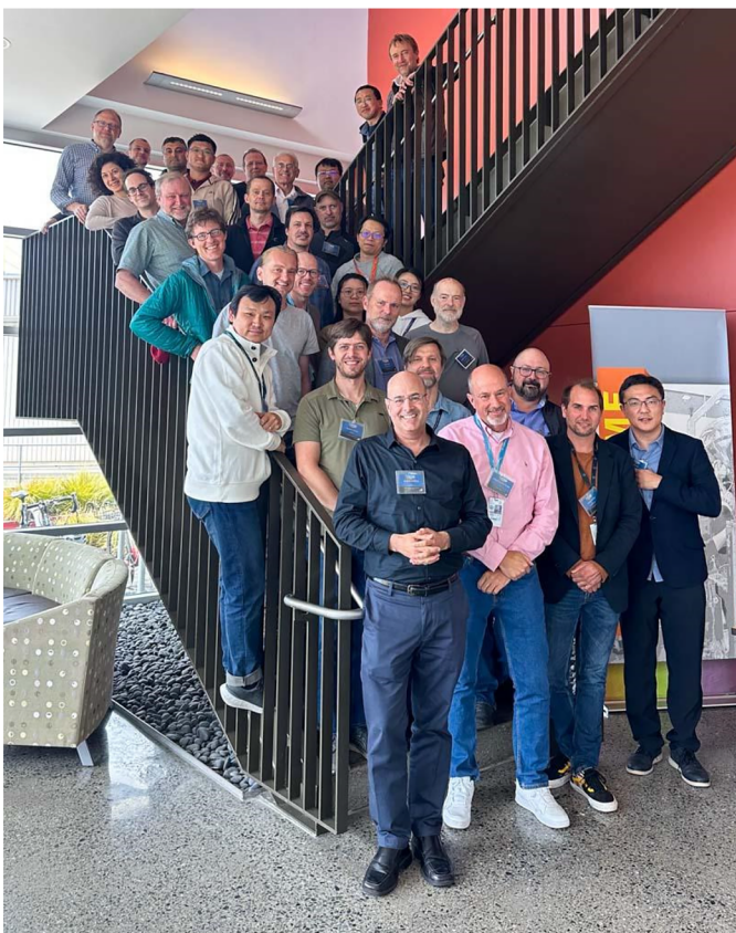
Figure 1. BLOMS 2023 in-person attendees and teachers.

Lectures included fundamental aspects of sources, optical coherence, mirrors, gratings, and optical tolerancing as a foundation for all other work. The overlapping and complementary ray-tracing and wave-propagation approaches are both accessible in the major modeling platforms that were presented. First is the OASYS Suite, which is a cross-platform application that integrates SHADOW for ray tracing, SRW (Synchrotron Radiation