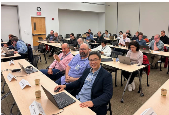
Figure 2. In the BLOMS 2023 classroom.

© 2023 The Author(s). Published with license by Taylor & Francis Group, LLC